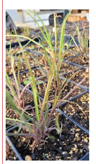
Spiderwort (Tradescantia ohioensis)