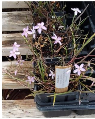
Spring Beauty (Claytonia virginica)