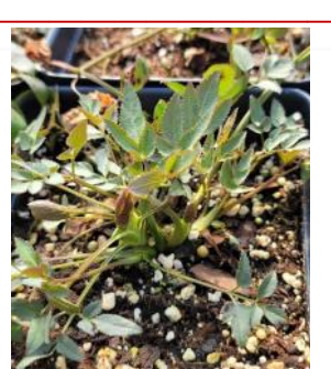
Golden Alexander (Zizia aurea)