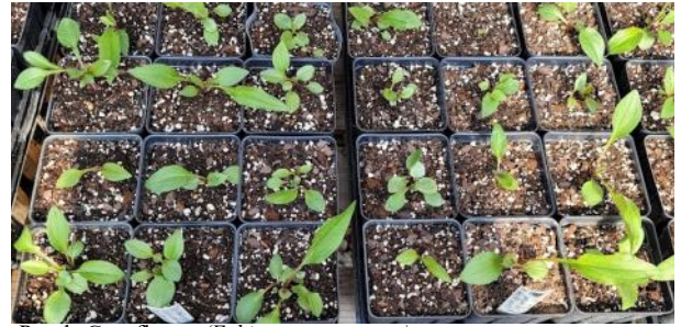
Purple Coneflower (Echinacea purpurea)